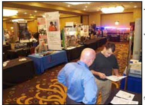
The large vendor room in the Embassy Suites Hotel in downtown Des Moines.

Loder also introduced DCI S/A Beth Reuter, who will assist agencies in tracking weapons used in crimes. This concluded the 2014 Winter School with 160 attendees.