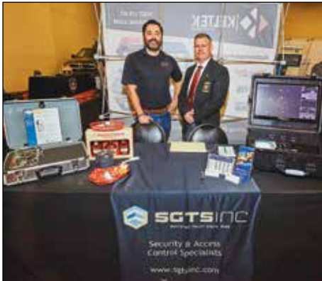
SGTS Inc.: Security & Access Control Specialists