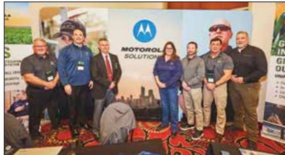
Motorola Solutions: Critical Communications