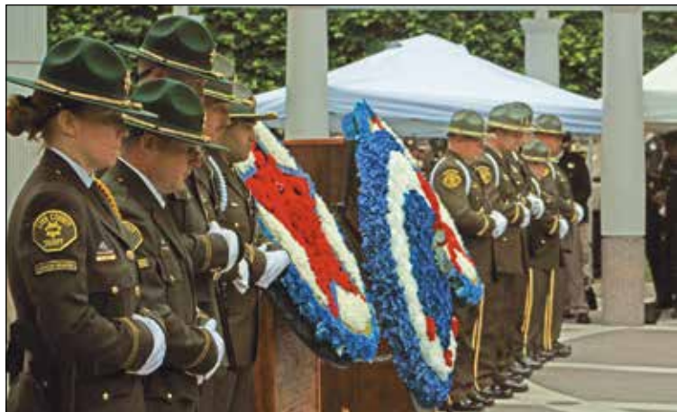
ISSDA Honor Guard standing watch at the National Law Enforcement Officers Memorial 2024 in Washington, D.C.