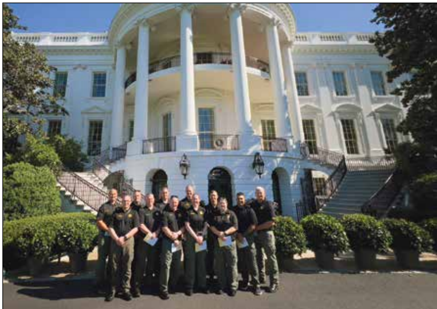
The ISSDA honor guard posing in front of the White House.