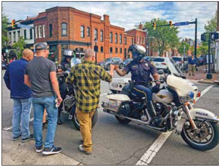
ISSDA Honor Guard members talking with motor officers while exchanging patches and coins in Washington, D.C.