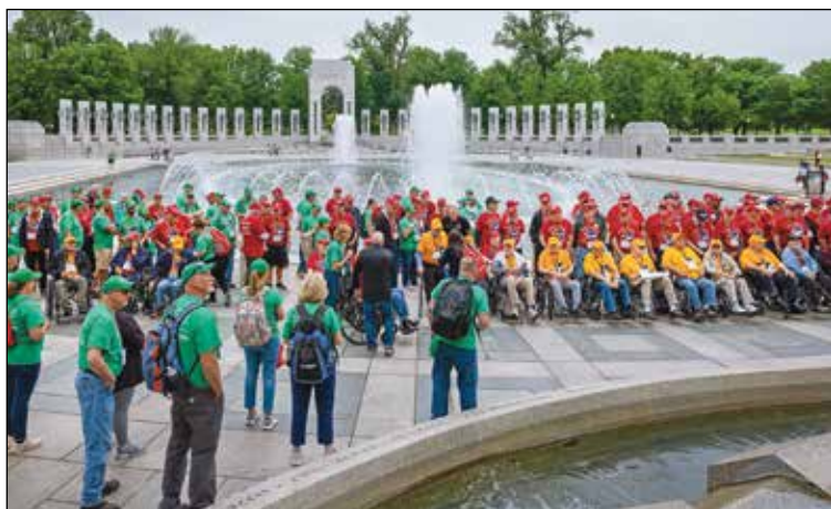
The ISSDA Honor Guard members came upon a group of veterans visiting the World War II Memorial in Washington, D.C.