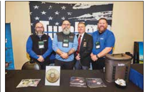
Turnkey Solutions: jail technology, inmate commissary, inmate communications