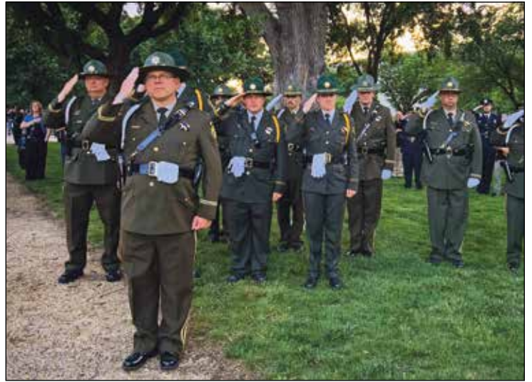
ISSDA Honor Guard saluting at the Peace Officer Memorial Service in Washington, D.C.