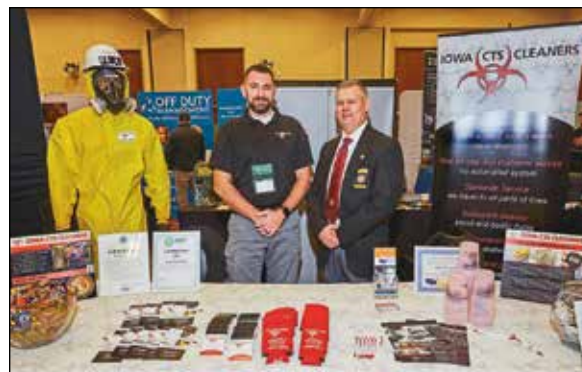
Iowa CTS Cleaners: 24 hrs/day, 7 days/ week, Crime & trauma scene cleaning