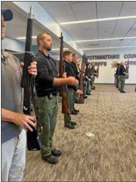
Above: Training in the Pottawattamie County S.O. Training Room. Below: At the Underwood Lutheran Church.