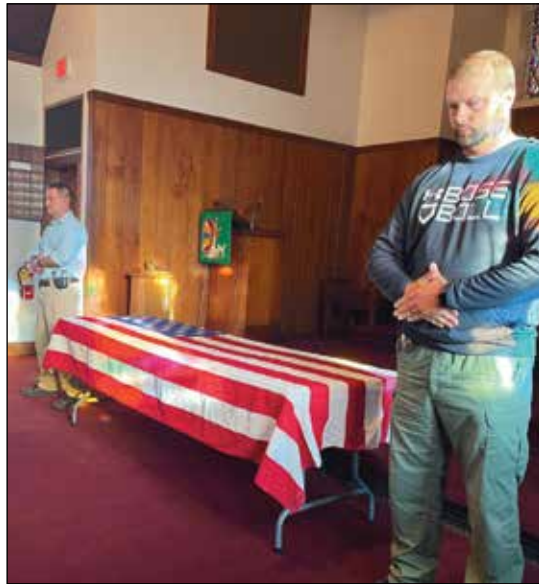
Above and above right: Training at the Underwood Lutheran Church.