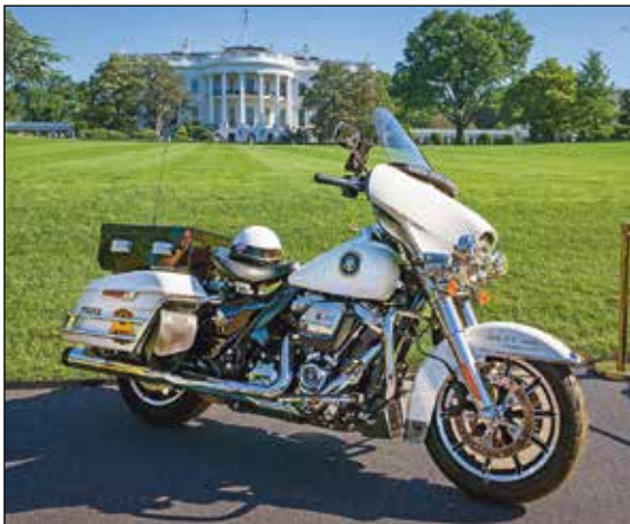
Secret Service Uniform Division motorcycle.