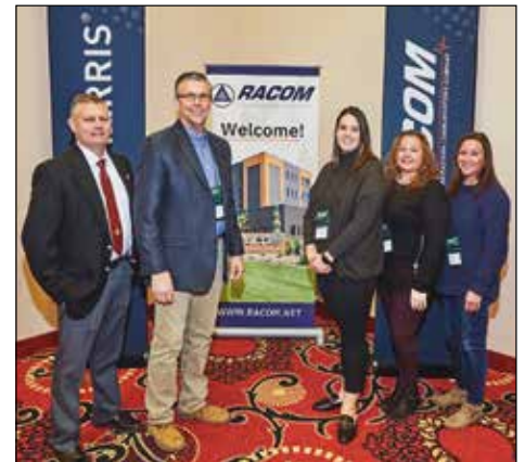
RACOM: Rugged, robust, resilient technology with reliable, responsive & relentless support.