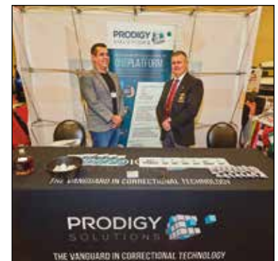
Prodigy Solutions: The vanguard in correctional Technology