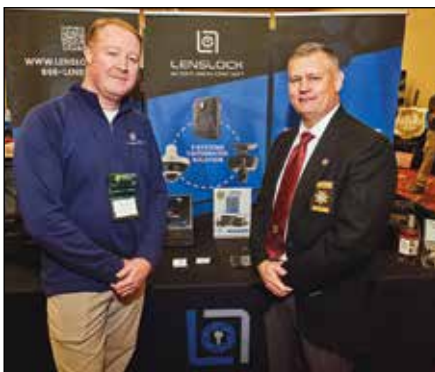
LensLock: Three systems, one integrated solution