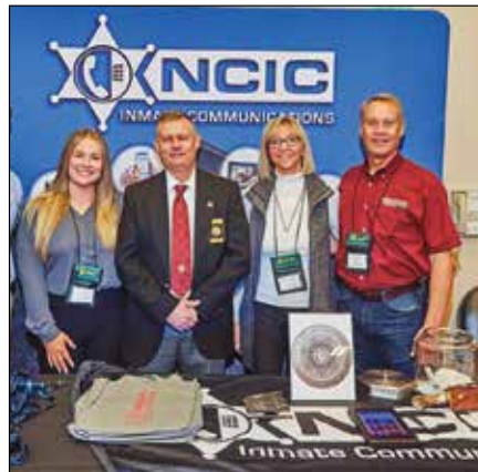
NCIC Inmate Communications: Longest running telecom carrier