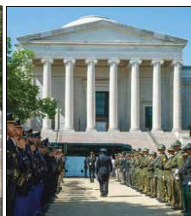
The Tomb of the Unknown Soldier in Arlington National Cemetery (left), and the ISSDA Honor Guard with other honor guards in formation at the Washington D.C. Art Museum as fallen officers' families arrived for the Peace Officer Memorial. (More on Pages 16-17)