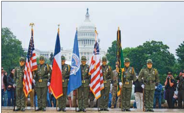
An Honor Guard in front of the U.S. Capitol building.