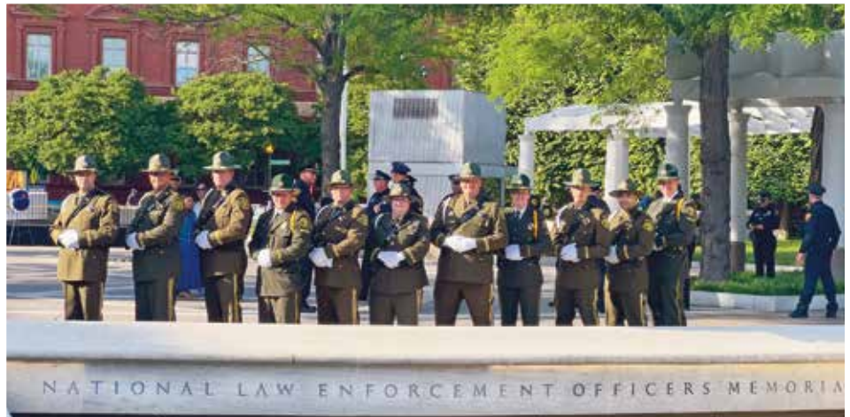
The ISSDA Honor Guard at the National Law Enforcement Officers Memorial.