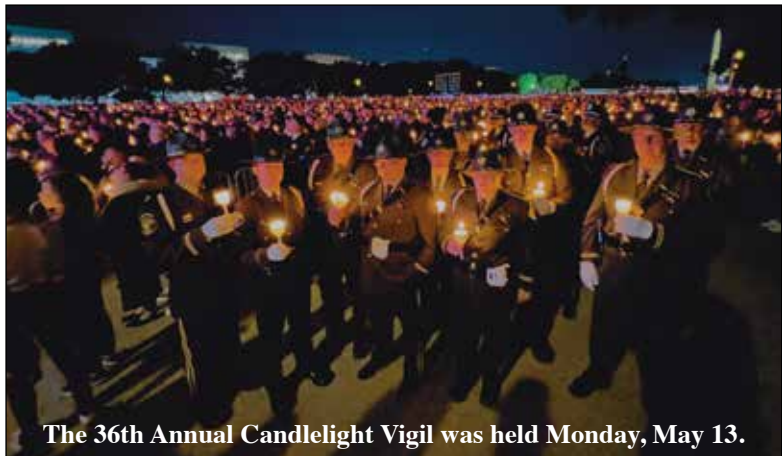
The 36th Annual Candlelight Vigil was held Monday, May 13.