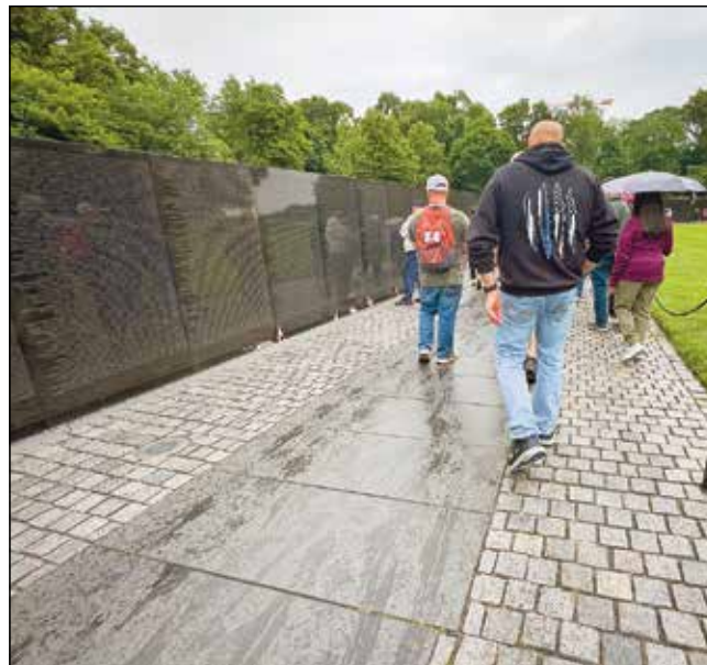
The ISSDA Honor Guard and family visiting the Vietnam Veterans Wall Memorial in Washington, D.C.