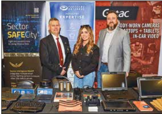
Getac Corporation: Global leader in rugged mobile technology and intelligent video solutions