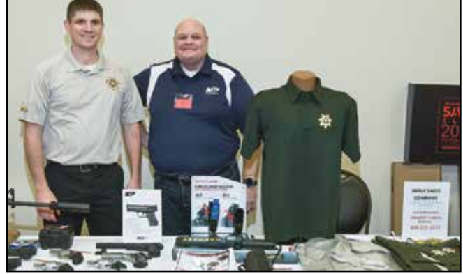
Shive-Hattery sponsored the President's Reception.