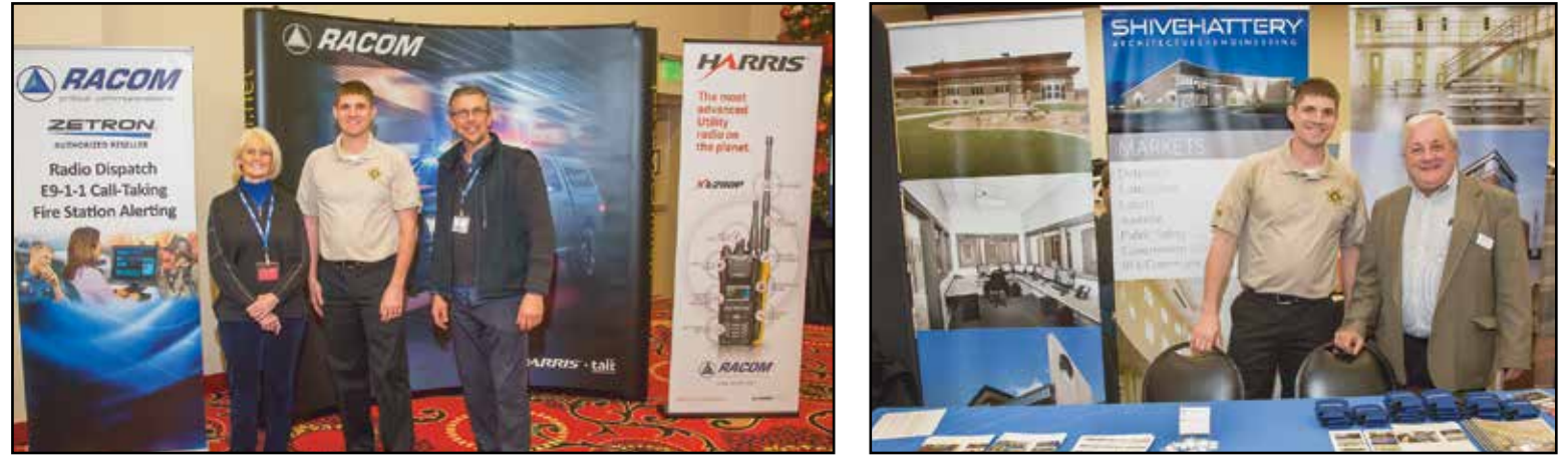
RACOM sponsored a break