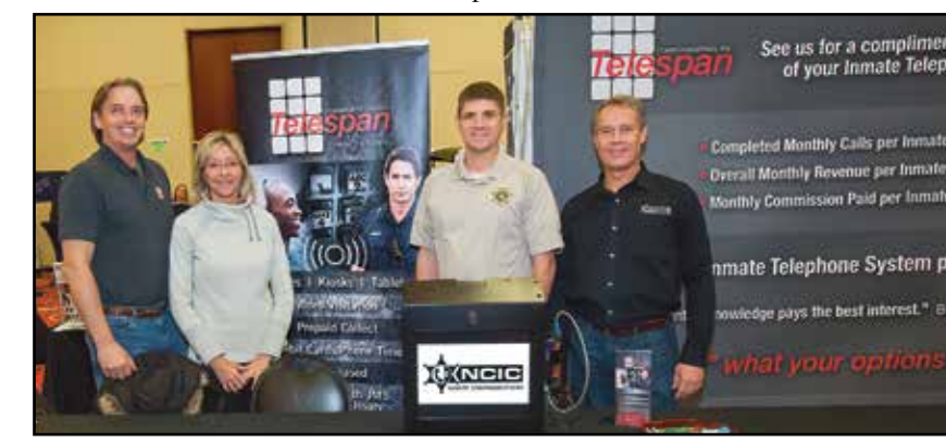
Telespan sponsored the Sunday night buffet.