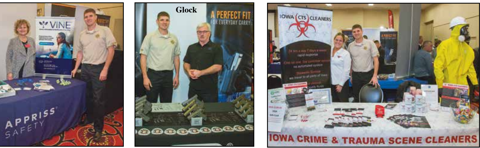
Above, Appriss Safety sponsored the Sunday night entertainment. Glock sponsored a gun raffle. Iowa Crime & Trauma scene Cleaners sponsored the Monday morning break. Also, thank you to all the vendors for giving out door prizes (below right photo).