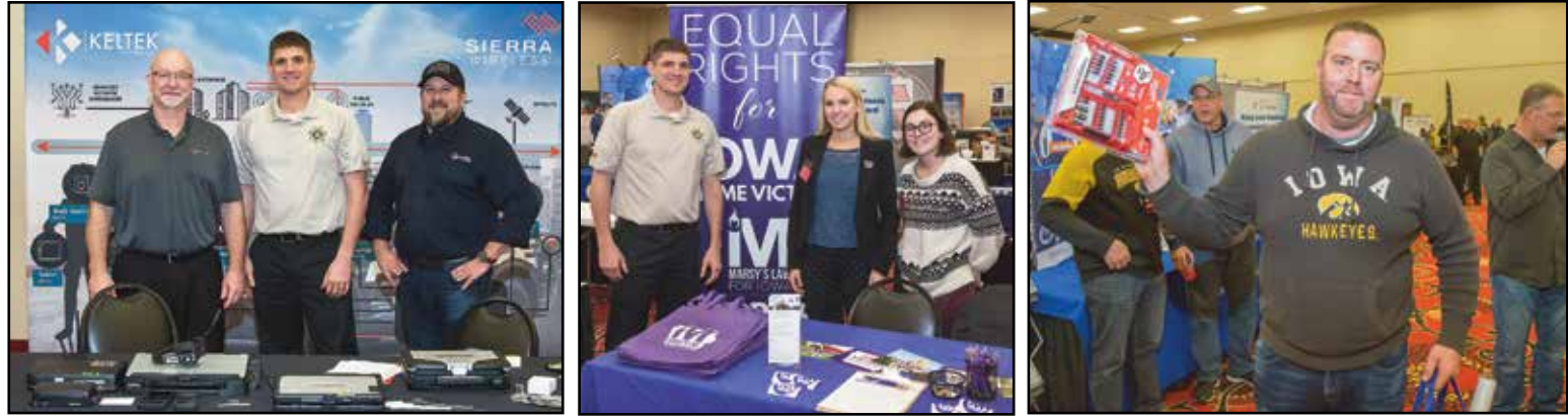
Above, Keltek sponsored a Monday night hospitality suite. Marsy's Law Iowa sponsored a break. In the right photo: a lucky door prize winner.